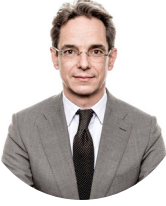
VALÉRY DENOIX DE SAINT MARC